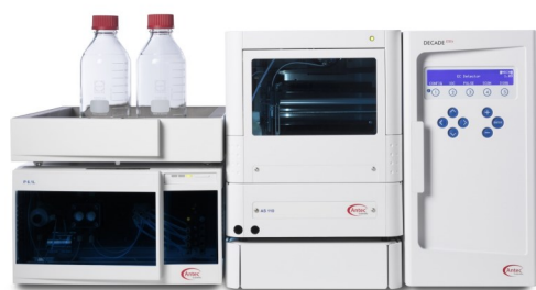
Fig. 1. ALEXYS Analyzer

3-Hydroxykynurenine (3-HK or 3-HKyn) is a metabolite in the kynurenine pathway, the major route of tryptophan degradation in mammals. 3-HK is a potential endogenous neurotoxin whose increased levels have been described in several neurodegenerative disorders [1]. The ALEXYS Neurotransmitter Analyzer is a versatile system for the trace analysis of various neurotransmitters, like catecholamines, serotonin, acetylcholine, GABA, Glu and other amino acids [2-4]. This note shows the proof of principle for the analysis of 3-HK using the ALEXYS Neurotransmitter analyzer.